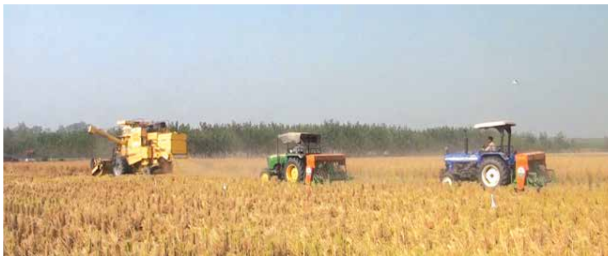
Figure 3. Concurrent use of SMS-fitted combine for harvesting rice and sowing of wheat by two Turbo Happy Seeder for efficient operation.

The cost of each super SMS attachment is approximately Rs. 1.2 lakh, and the cost of Turbo Happy Seeder is about Rs. 1.3 lakh. These costs can easily be recovered by the custom hiring service providers, through marginal increase in the charges for custom hiring. Considering the economic advantage to the farmers and other environmental and social benefits of the technology package requiring concurrent use of SMS-fitted combines and Turbo Happy Seeder compared over the conventional tillage based management practices, this innovative technology is expected to be adopted by the farmers very fast. Though the adoption of this technology has remained slow in past but with the introduction of complete package specially the super SMS attachment with combine harvesters coupled with awareness campaign by range of stakeholders, the technology is gaining popularity. Accordingly, within past couple of months in Punjab alone, over 1000 combine owners have already mounted Super SMS and a demand of nearly 2000 happy seeders has been put to manufactures. This shows scalability potential of the technology.