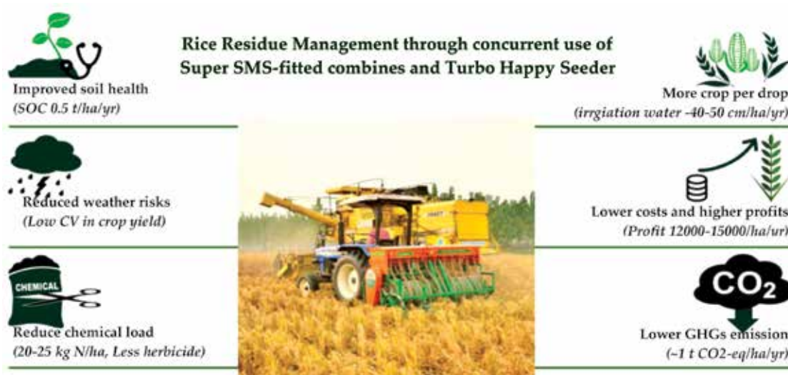
Figure 4. Multiple benefits of the rice residue management through concurrent use of SMS-fitted combines and turbo happy seeder 2,4,7,12,13 .